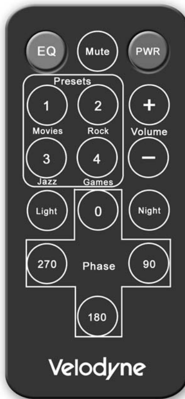
Figure 3. Remote Control

NOTE: The SPL-Ultra remote can be attached magnetically to the back of the subwoofer in the upper left hand corner.